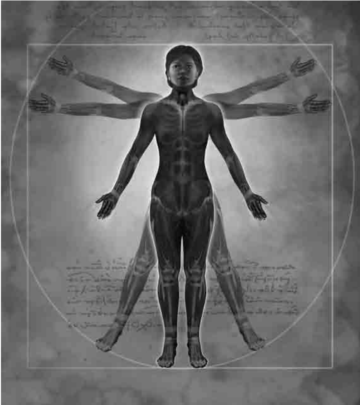
Figure 1.2 New Vitruvian Woman