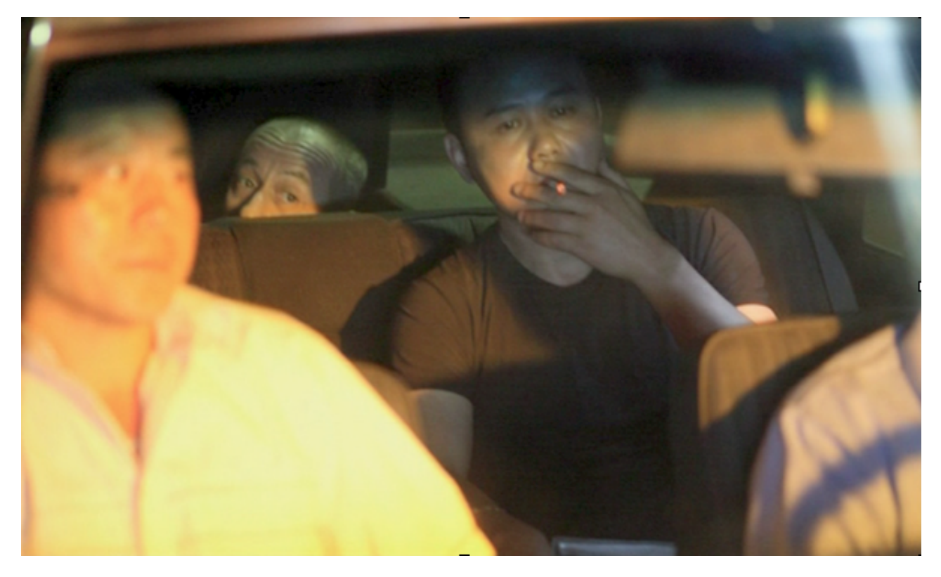
FIG.1. Xian and the Chinese driving the tailor Pasquale to an illegal factory.

The common denominator of these stories lies in their allegorical value. The characters are executioners and at the same time victims manipulated by invisible forces. They live the illusion of cutting their own deals with the crime system, of bending its savagery to their own ends. Garrone focuses on the wretched of the earth: Camorra's daily laborers and foot soldiers operating in the suburbia. While minor in the book, these characters are elevated to protagonists. Despite the limited scope of the film, the idea of the Camorra as a global phenomenon is suggested through the presence of Nigerian and Chinese mafia (FIG.1), and by the superimposed text that appears at the end of the film, stating that the Camorra has invested in the rebuilding of the Twin Towers site.